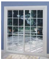
Model 312: Sliding Patio Doors (Special Order)