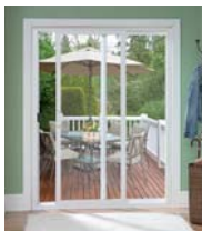
Model 311: Sliding Patio Doors