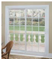
Model 332: Sliding Patio Doors