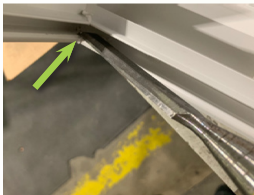
Flip Window Over and Clean Opposite Side of Screen Track