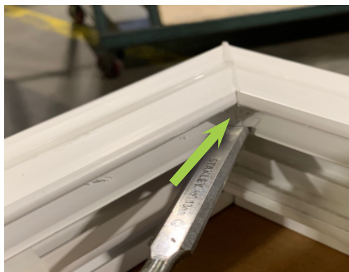
Remove Weld Flash with Chisel (Both Left and Right Top of Screen Track)