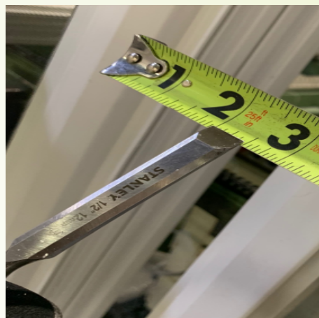
Use a Sharp 1/2 Inch Chisel to Remove the Weld