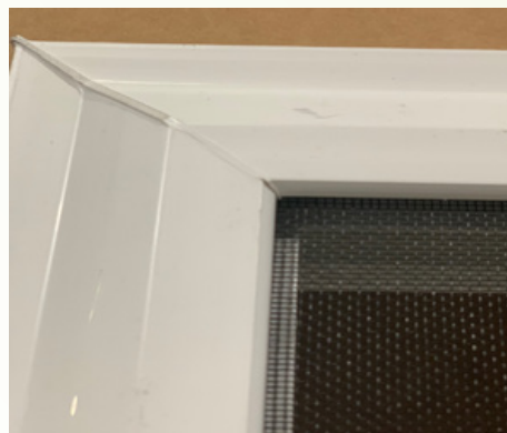
Install FLEXSCREEN Into Track