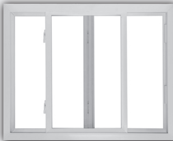
130 2-lite slider with front flange