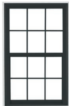
Series 150 black laminate exterior with white interior

Go bold with a color that turns windows from something overlooked into the focal point of the home's exterior, for a great value