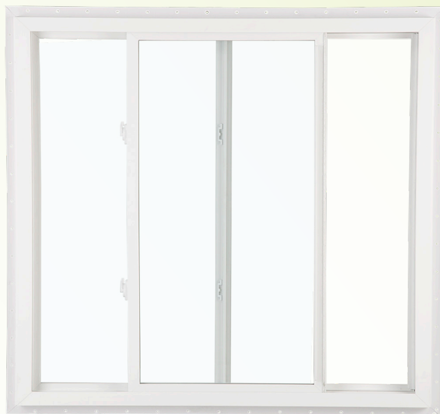
2-lite sliding window