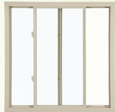
2-lite sliding window