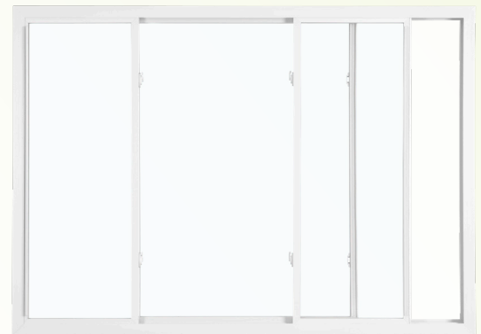
3-lite sliding window