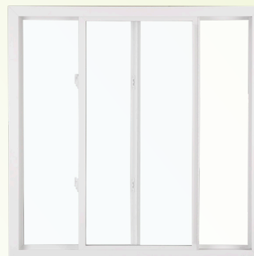
2-lite sliding window