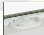
Featuring Our New Low Profile Lock