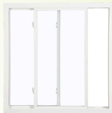
2-lite sliding window