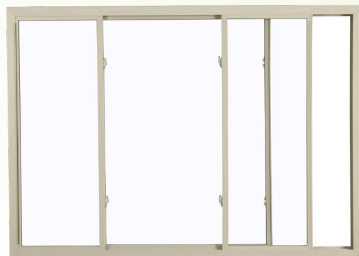
3-lite sliding window