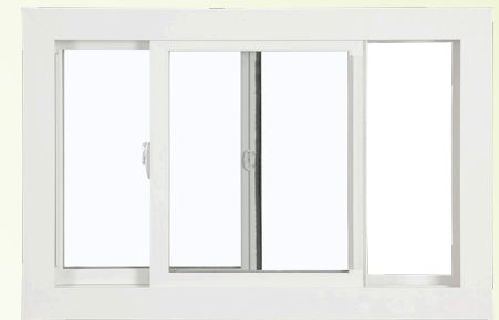
2-lite sliding window