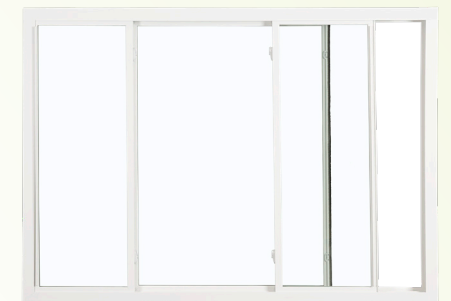
3-lite sliding window