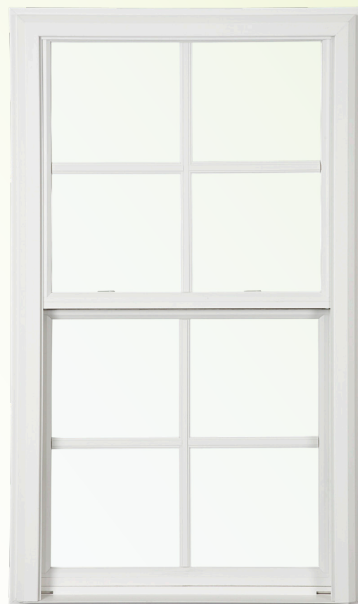
Series 8900 with SDL