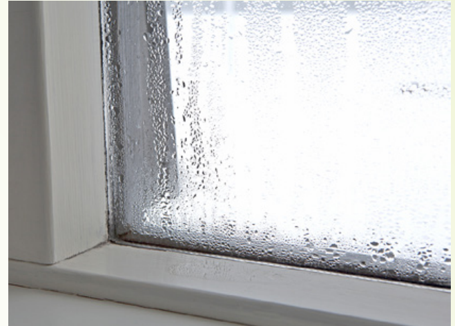
Condensation is a normal occurrence