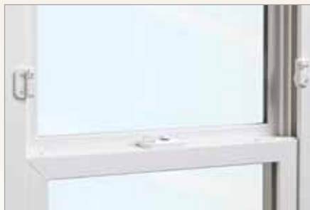
FIELD APPLIED WOCD: WOCD engaged, window closed