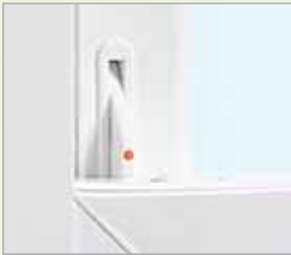
FACTORY APPLIED Window Opening Control Device (WOCD)

FACTORY APPLIED KIT available for: Series 8300/8700/8900 DH • Series 130 SH • Series 150/160 SH • Series 450/455/460/465 DH • Series 5700 SH • Series 8050 SH