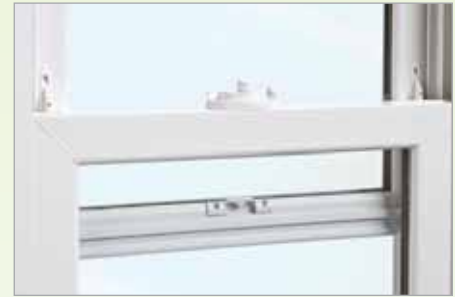
FACTORY APPLIED WOCD: WOCD engaged, window opened

FACTORY APPLIED KIT available for: Series 300/375 SH