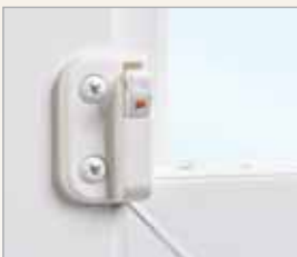
FIELD APPLIED Window Opening Control Device (WOCD)

FIELD APPLIED KIT available for: Series 151/161 Sliders • Series 8300 Slider