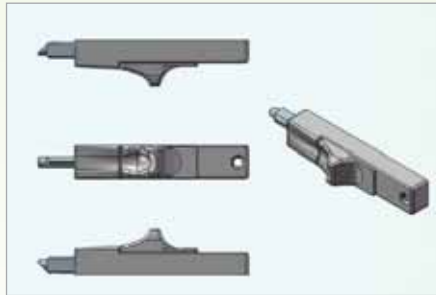
FACTORY APPLIED WOCD: WOCD diagram views