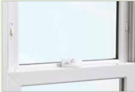
FACTORY APPLIED WOCD: WOCD engaged, window closed