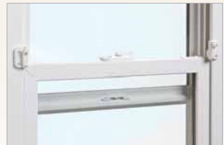
FIELD APPLIED WOCD: WOCD engaged, window opened